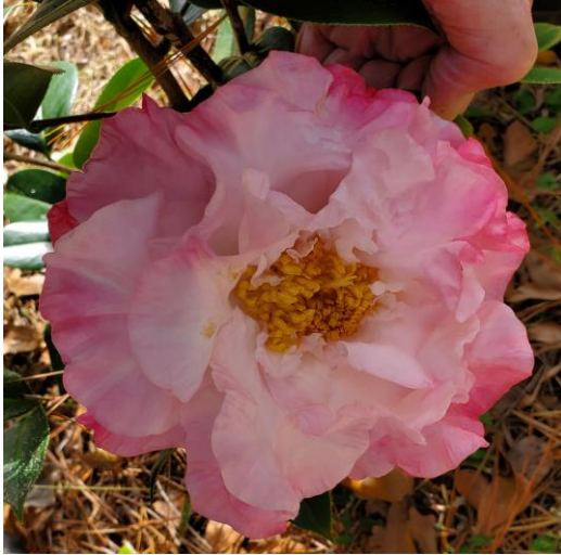
Evening Glow Pearl